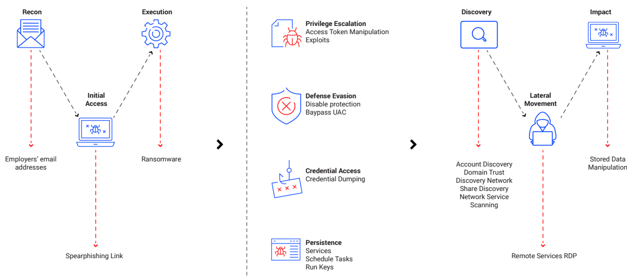
Figure 2: Ransomware attack tactics and the typical cyber kill-chain

Beating ransomware requires understanding the full cyber kill-chain and mapping defenses to each attack stage.